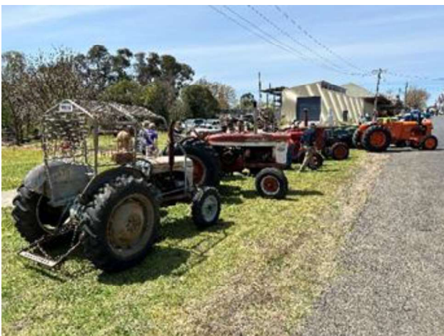
A mix of tractors on display Ferguson / McCormick - International / Farmall - International / Chamberlain