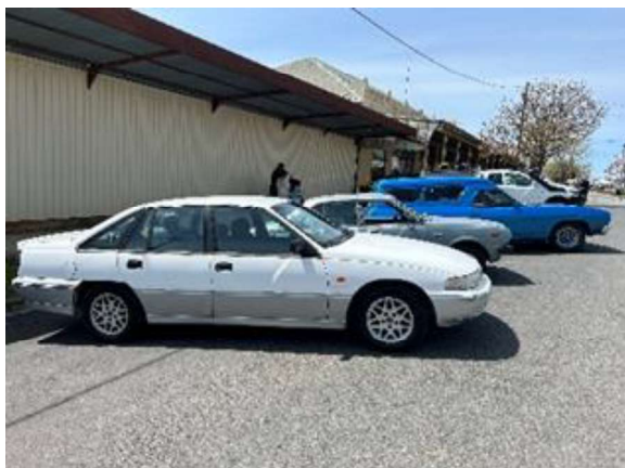
1992 VP Holden Commodore / 1976 Toyota Corolla sedan / 1977 XC Falcon panelvan - Part of car display