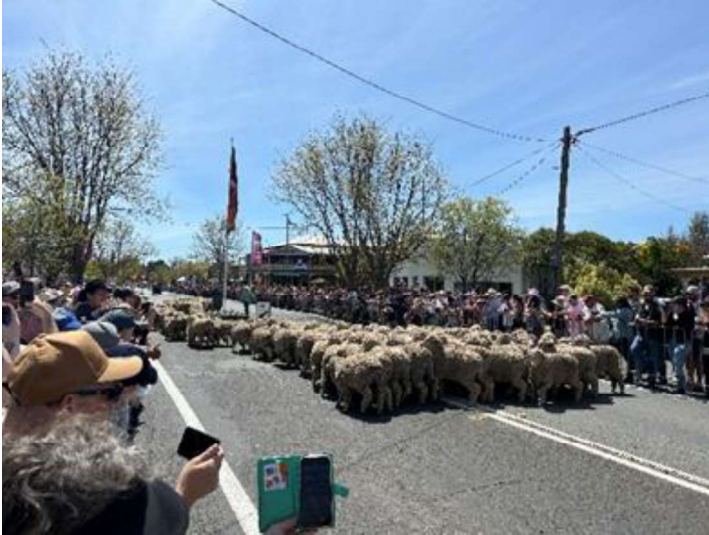
The running of the sheep