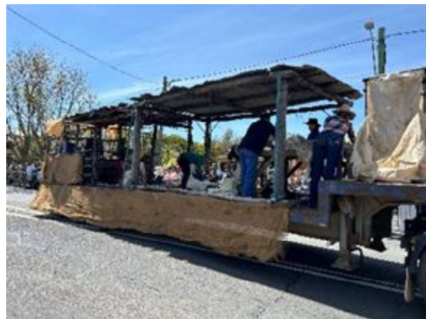
Freightliner semi trailer used as a mobile sheep sheering shed