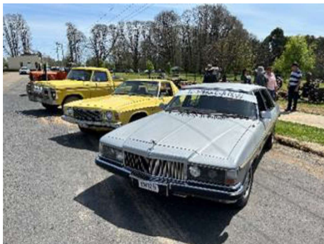
1982 Holden Statesman / 1978 Holden Ute / 1977 Ford F100 pickup Part of car display