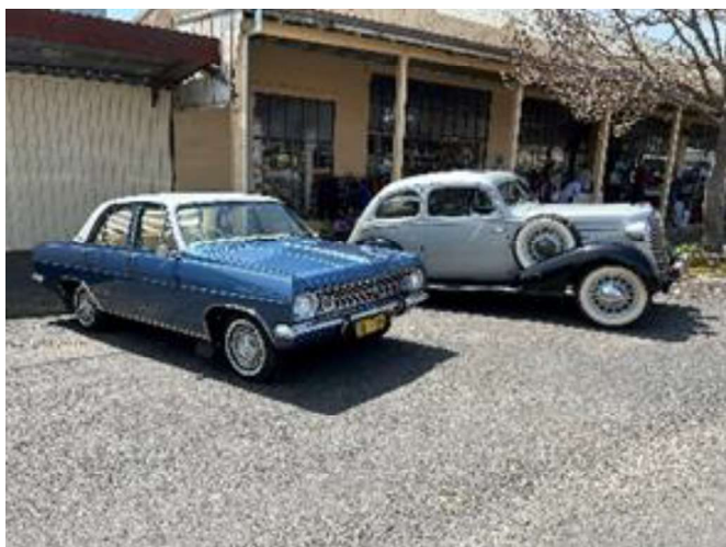
1967 Holden Premier / 1936 Chevrolet sloper - Part of the car display