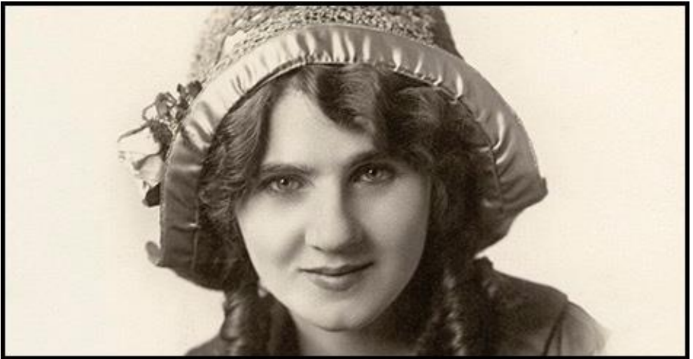
Florence Lawrence, star of stage, screen, and turn signals.

Sadly, Florence didn’t patent her invention, the “auto signaling arm” and then fell victim to some unlucky life events from then on out.