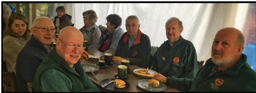
November 2021 morning tea crew