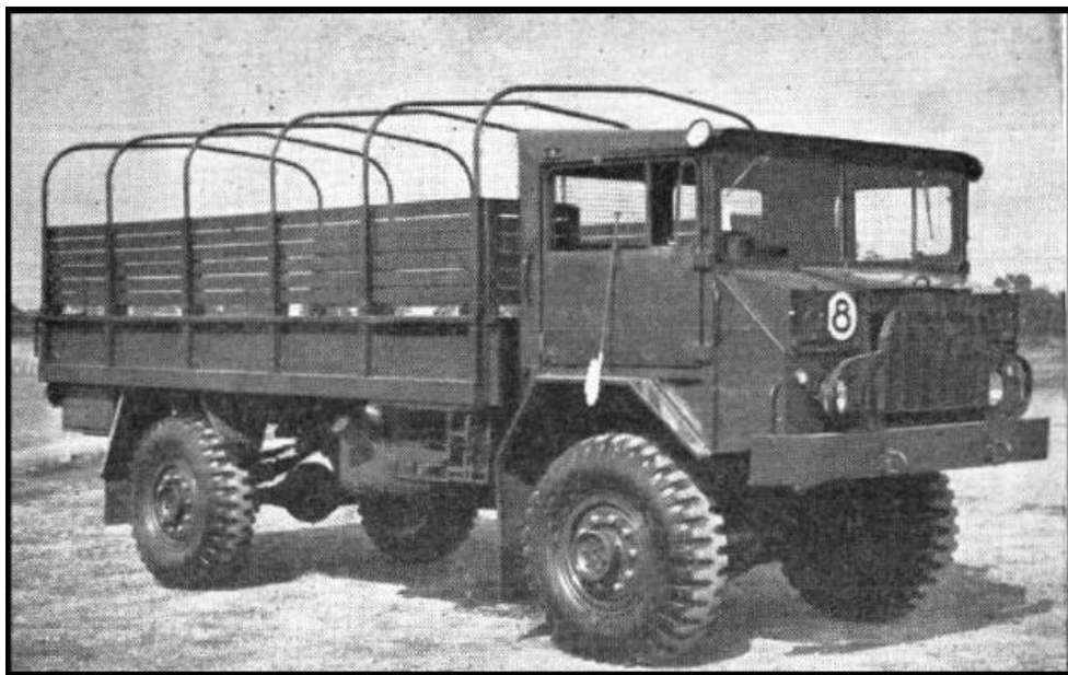
Truck Cargo. 2.5 ton Aust. No 1 Mk 1 (image from the internet)

International Harvester Australia was eventually awarded a contract for four-wheel drive military trucks. While the trucks were designated Mk1 these trucks were AACOs .