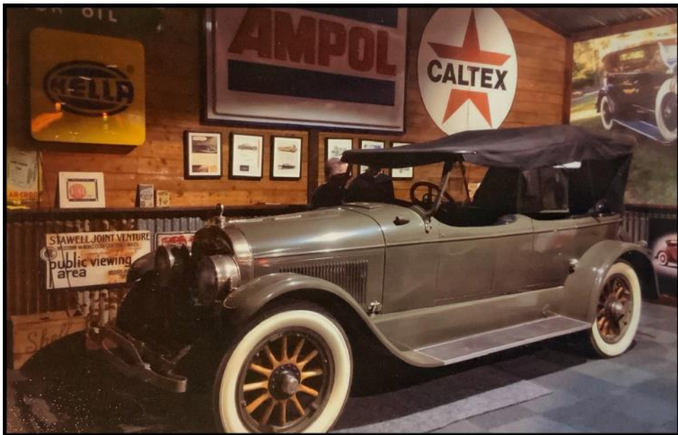
1922 Lincoln Model L

At the age of just 18, his first car was a Gold 1972 Lincoln Town Car. That was a big deal.