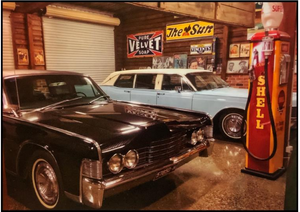
1965 Lincoln Limo-Black and a 1968 Lincoln Limo Blue.

I am sure this collection would have to be of a world standard.