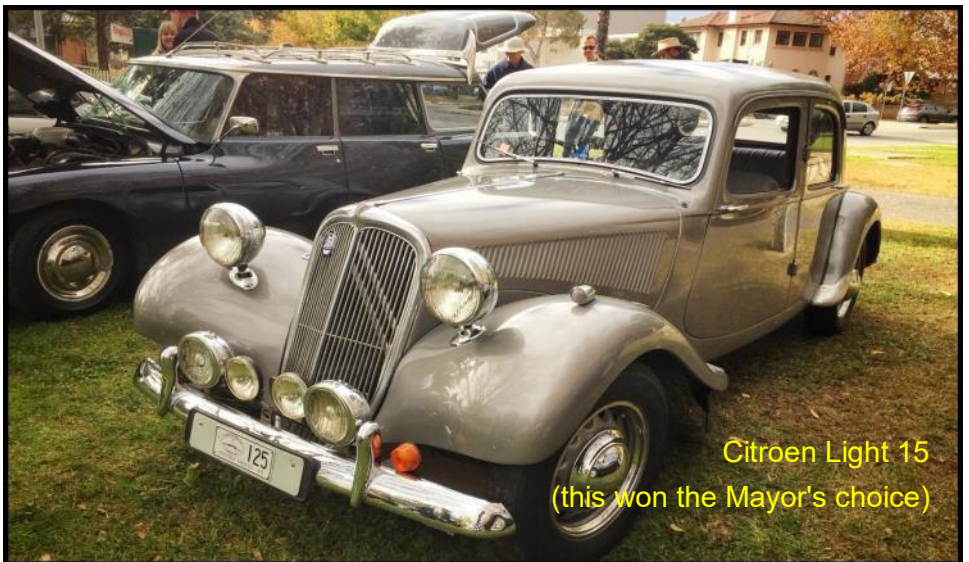
Citroen Light 15 (this won the Mayor's choice)

The sight of a nicely restored Citroen 2CV, a Light Fifteen, a couple of DS 23 s, a Maserati powered SM and some of the more modern offerings from Citroen, paid homage to the Citroen history. Renault owners participated with a R11, R12, a R16TL, a couple of Alpines and some modern Renaults to remind some of us of their illustrious history. There were Peugeots there too. Several 203s in various body shapes but alas a deficiency of 403, 404, 504 models which some of us still remember as new cars in the showroom of the local dealer.