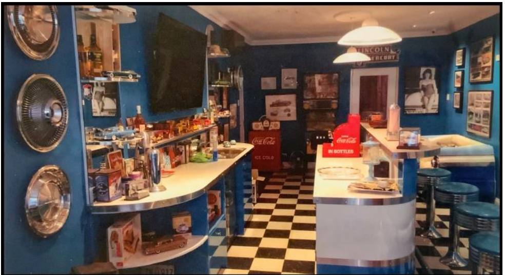
A very nicely laid out dinner and bar off the big garage.