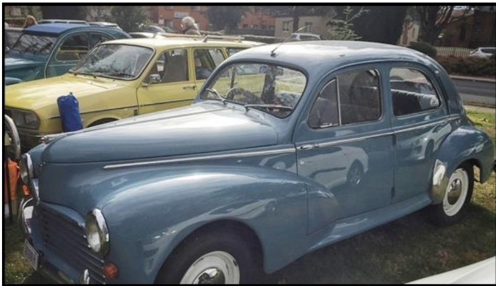
Peugeot 203 with a Renault R12 in the background.

The French marque car clubs in the capital region have for many years provided a fun day out for themselves and their British vehicle owner friends. The excuse for this day is the 1815 Battle of Waterloo. Famous for numerous modern things including meeting one's Waterloo and Wellington boots (wellies) and of course of the name of that famous brandy.