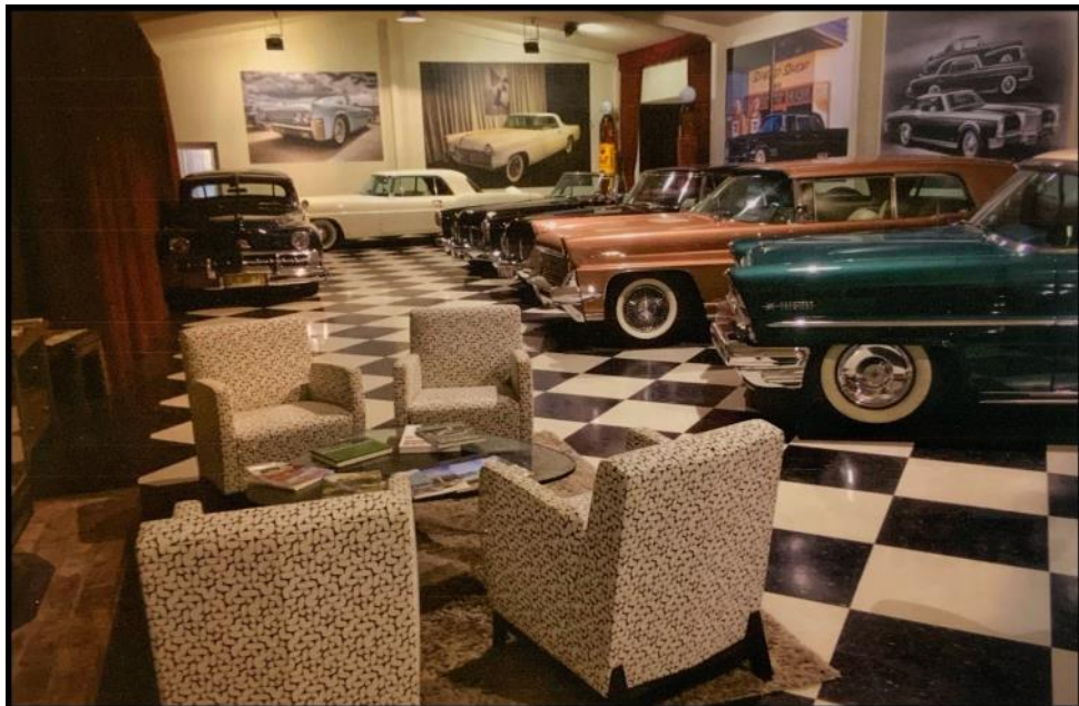
"Lounge room" style display of Lincolns

His company was called Grampian Excavations as he lived at the foot of the Grampian mountain range in Victoria in a town called Stanwell.