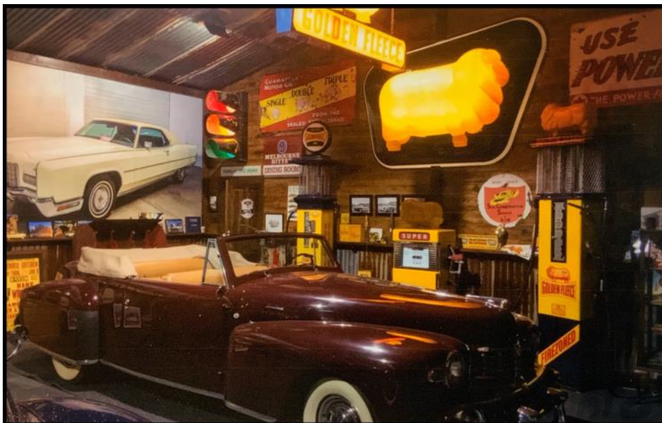
1948 Lincoln Cabriolet with Golden Fleece pump and signs