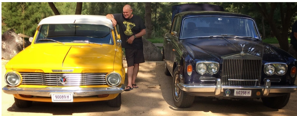
Photo above from the President's Twilight run