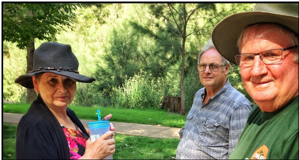
These STHARC members are watching you!

The 1500 had the same wheelbase as the Beetle and retained much of the traditional Beetle technology (two doors, rear, air-cooled motor, front torsion bar suspension, 6 volt electrics etc). However, it was a little wider and longer than the Beetle, with more 'luxury' features and bigger windows, providing a more open, spacious and comfortable cabin. The more powerful motor provided stronger performance than the 1200 Beetle motor and was much flatter, allowing the 1500 to have a second boot in the rear, as well as the one up front.