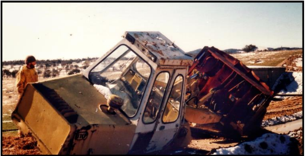
Photo above is from the late eighties when I bogged my JCB110B due to melting snow. I still have it and was using it just last week when one of the tracks "broke". I guess it could be classed as having a flat tyre!

The 112 was introduced in July 1975, powered by a 6 cylinder Perkins engine producing 101 bhp, and the 114 came along in January 1976 and that had a 6 cylinder Perkins engine producing 126 bhp, it was at this time the 110 had the engine updated to 73 bhp and renamed the 110B.