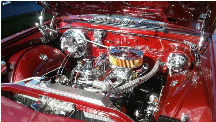
The winning car at Chromefest.

Warning if you attend next year do not forget your sunnies as the shine of the chrome is blinding!!!!!!!!!!!!!!!!!!!!!! Cheers Tom Warren