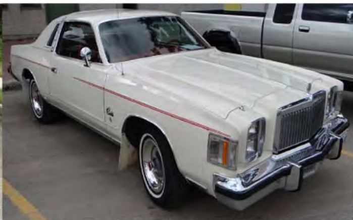
A lovely original Chrysler Cordoba.