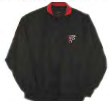
MCAAC Windbreaker with crest and your name