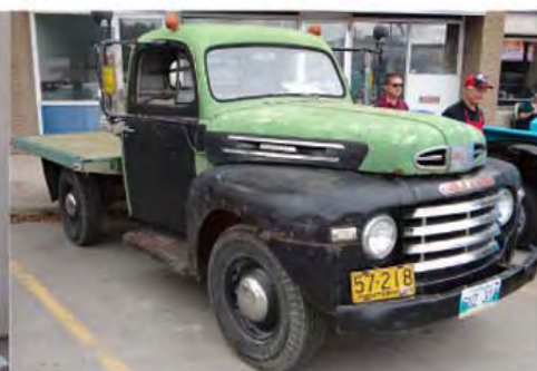
A Canadian Mercury truck, an ageless MCAAC member, and another Mercury truck.