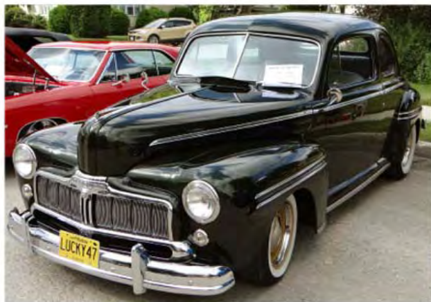
A sweet little '47 Canadian Mercury coupe.

Another great Beausejour Shades of the Past show.. Well over 600 vehicles showed up on a gorgeous late Summer day. All sorts of different vehicles for all tastes. For those of you who have never been to this show, you're missing out on a fun event.