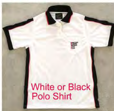
White or Black Polo Shirt