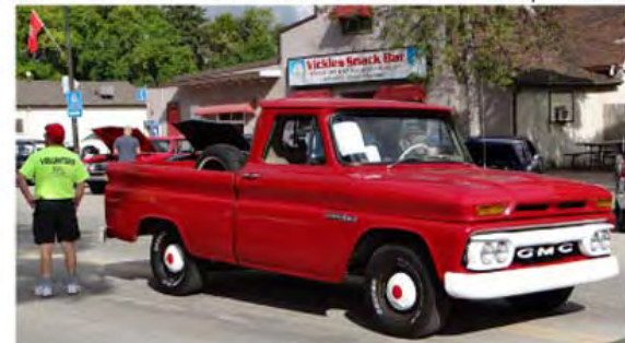
A nice GMC in front of a Beausejour icon, Vickie's.