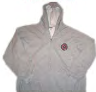
Black or Grey Hoodie S M L XL 2XL 3XL