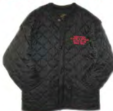
Quilted Men or Ladies Custom fitted jacket with crest from STAR