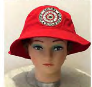
White or Red Bucket Hat