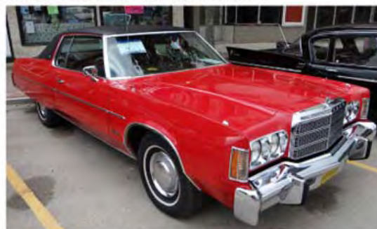
Big old 1970's Chryslers are great.