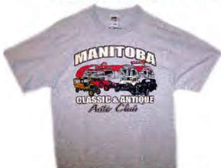
Half Moon T Shirt M L XL 2XL

For MCAAC windbreaker and quilted jacket contact Star Sportswear 701 Henry Ave 204-774-0063