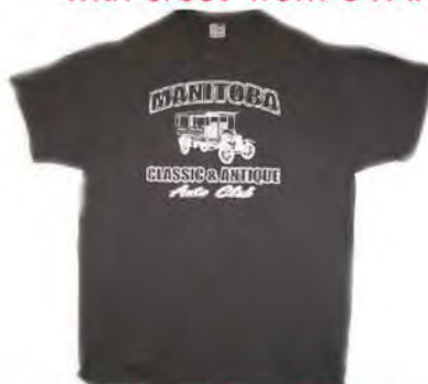
Black or Grey T Shirt M L XL 2XL