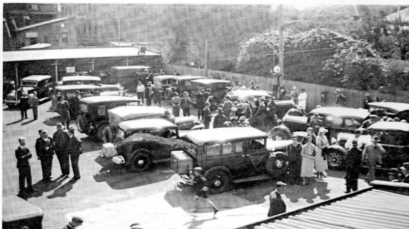
RAC Headquarters yard in 1934.

Could the Royal Automobile Club of WA escort 25 cars carrying 73 people over 4,600 miles of some of Australia's worst roads in 12 days with no serious mishap?