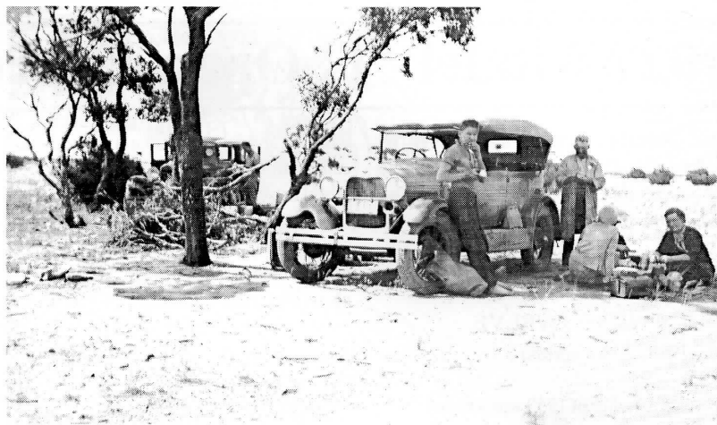
Lunch at Southern Cross.

On Wednesday 17th October, the cars left Gladstone and motoring through Clare, reached Adelaide to be met by Road Patrols of the Royal Automobile Association of South Australia.