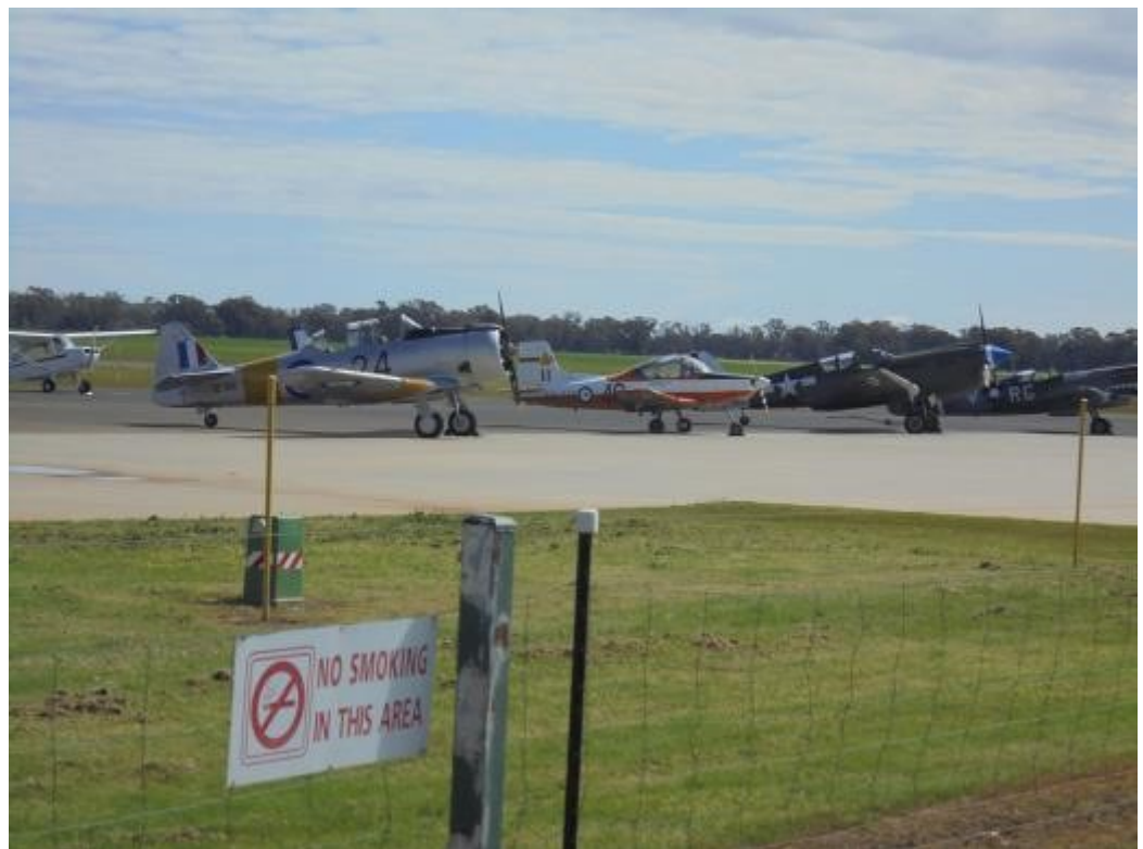
Line up of aircraft excluding Tiger Moth. Closest is Harvard, then CT-4, P40 and finally Spitfire