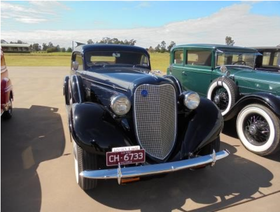
1935 Lincoln K Model from Victoria that has only covered about 30,000 miles since new!