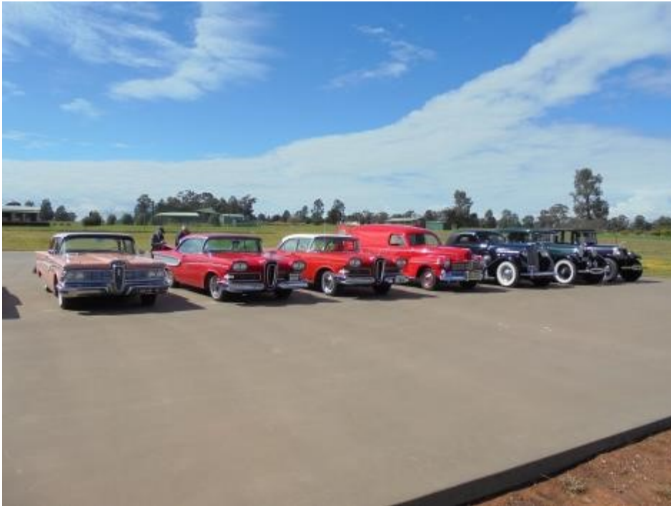
A line up of some of the cars at Temora Aviation Museum