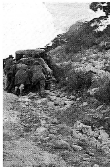
Helping a car over the Madura Pass.

In Part II we travel with the group on its return journey.