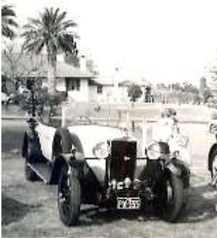
Among the entrants 1959 Anniversary Rally, Austinmer