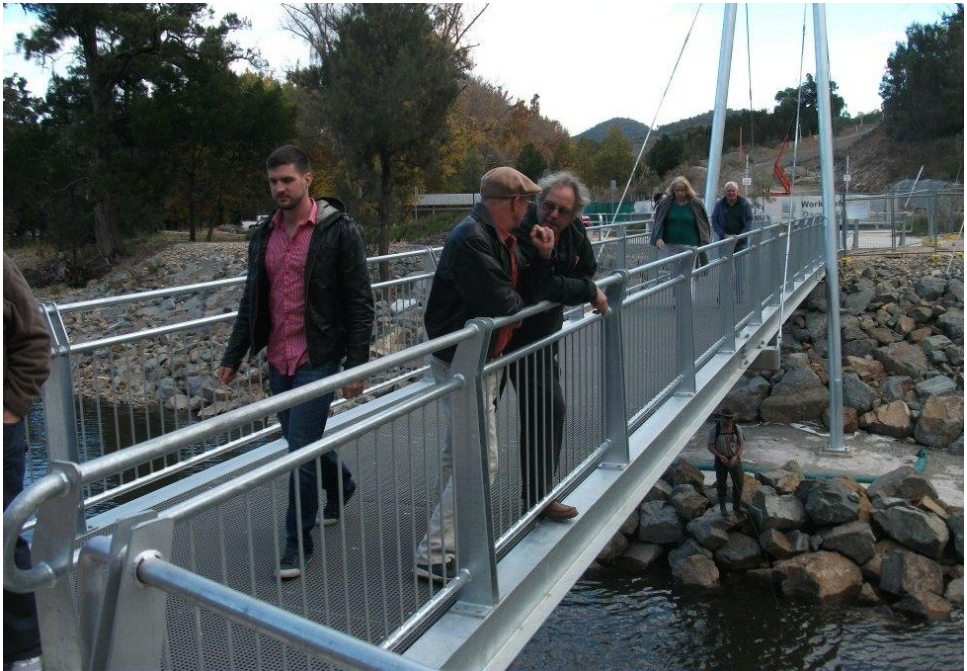
Cotter Dam Mid Week Run