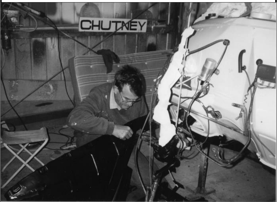
Relegated to the Garage! Complete with Mattress. The FJ completely stripped.