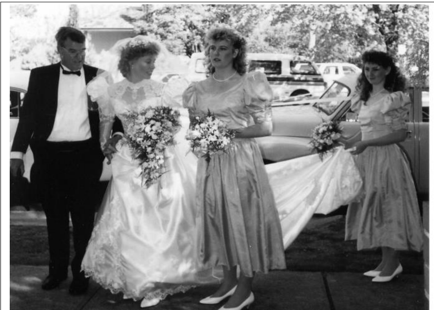
Beautiful Bride, with Handsome father and the FJ in the background. Oct. 1992